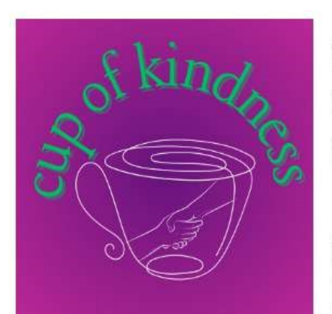
Building community through serving those in need in Ulverstone